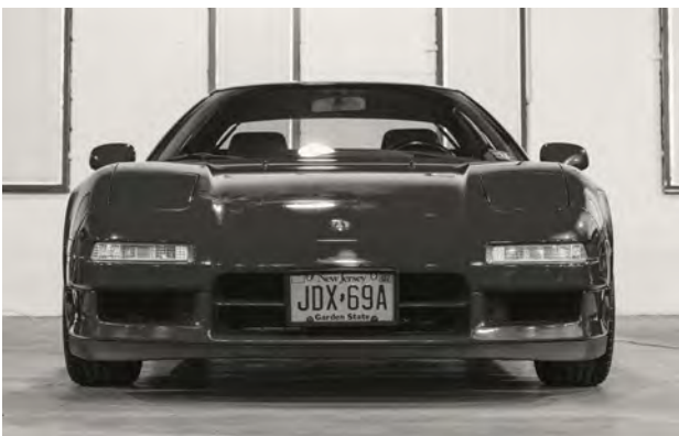
1999 Acura NSX