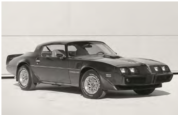
1979 Pontiac Firebird Trans Am