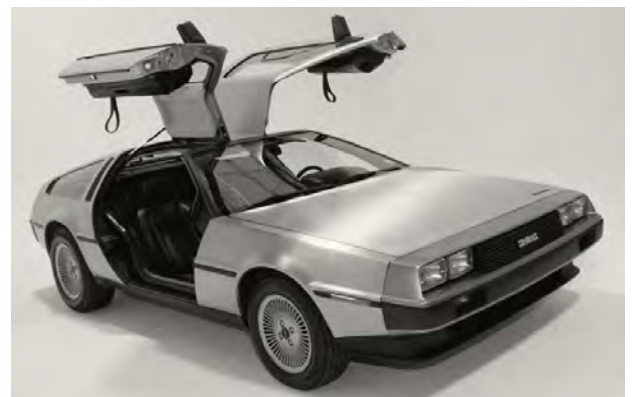
1986 DeLorean DMC-12