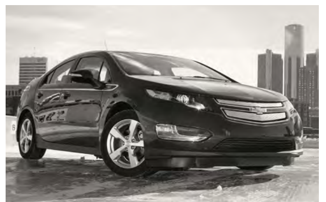
2011 Chevrolet Volt