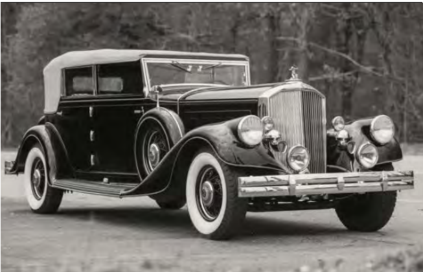
1933 Pierce-Arrow Model 1247