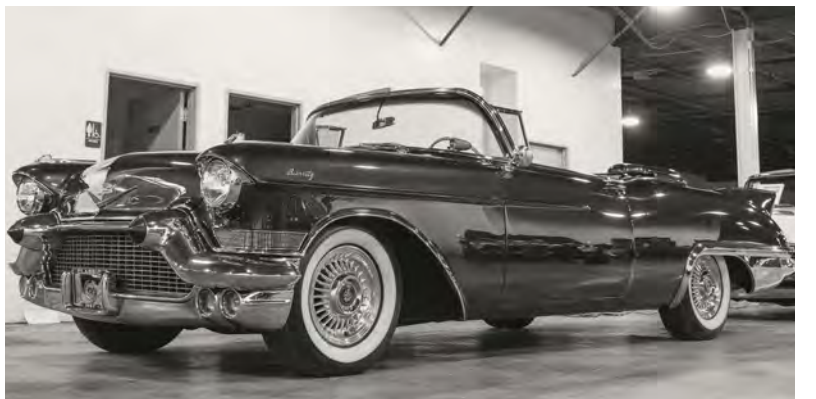
1957 CADILLAC ELDORADO