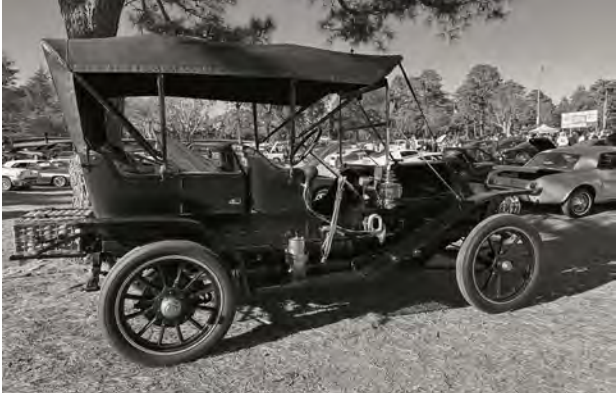
1909 Cadillac Model 30 Demi Tonneau

In 1900, New York City was abuzz with progress and possibility. The dawn of the 20th century saw the rise of a brand-new invention—the automobile. While horse-drawn carriages still filled the streets, a handful of visionaries saw the future, and they wanted to show it to the world. The First Annual Automobile Show was unlike anything the city had seen: over 160 gleaming machines filled the hall, from steam-powered delivery wagons to electric cars. This year's Heritage Exhibit brings that same spirit of wonder and discovery back to the Show floor. As we commemorate our 125th anniversary in 2025, this special exhibition invites you on a journey through time, showcasing the evolution of the automobile and the pivotal role our Show has played in shaping the industry. Here are the vehicles that will be displayed in the exhibit: