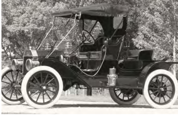
1910 Ford Model T