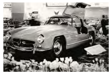
Heritage Exhibit: 125 Years of the New York Auto Show

As we mark 125 incredible years of the New York Auto Show, we’re pulling out all the stops to celebrate this milestone! While the dazzling OEM exhibits will take center stage, we’ve also curated a series of spectacular showcases that honor the rich history and remarkable achievements of the automotive world. Join us as we toast to 125 years of automotive excellence with these unforgettable displays!