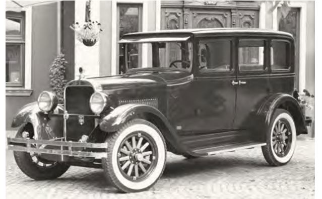
1927 Dodge Brothers Standard Six