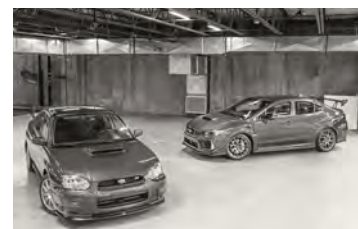
From Racing Roots to Rally Legends: The Subaru 'Born to Rally' Collection