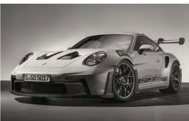
2022 Porsche 911 GT3 RS