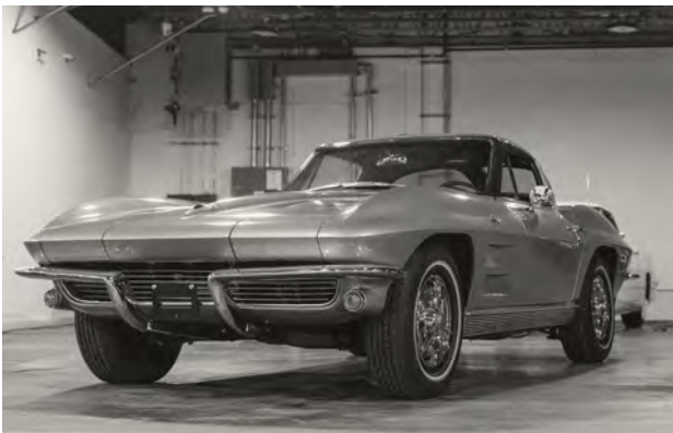
1963 Chevrolet Corvette Split-Window Coupe