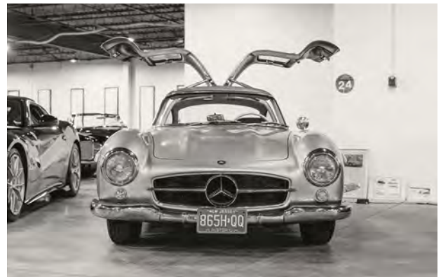
1955 or 1956 Mercedes-Benz 300SL Gullwing