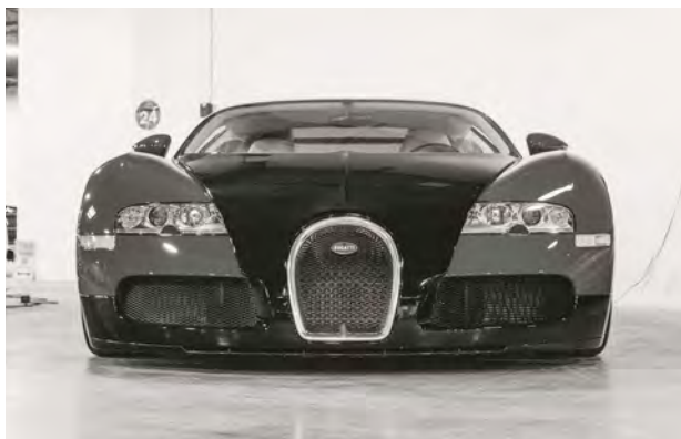
2006 Bugatti Veyron 16.4