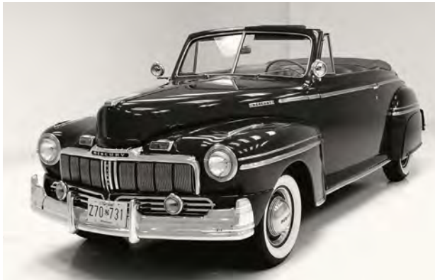
1947 Mercury Eight Convertible