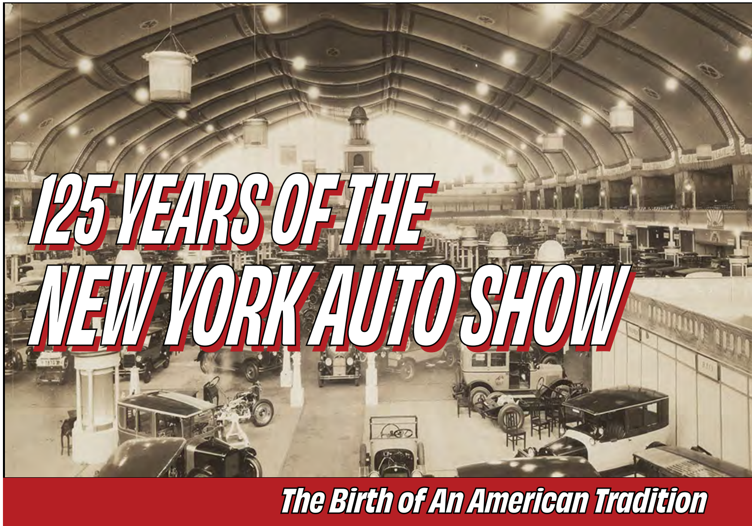
The first major auto show in the United States, held in New York City at Madison Square Garden on November 3, 1900. This groundbreaking event featured 69 exhibitors and drew more than 40,000 attendees, marking the beginning of America's fascination with the automobile.

The New York International Auto Show is celebrating its 125th anniversary—defining over a century of automotive innovation, style, and culture. The first show took place in 1900 at Madison Square Garden, where 69 exhibitors showcased the latest in transportation technology to more than 48,000 curious visitors. Tickets were just 50 cents, and vehicles ranged in price from $280 to $4,000. That historic event was a defining moment in American history, introducing the masses to the automobile and paving the way for a revolution in mobility.