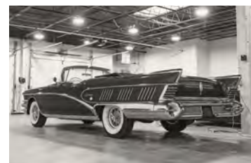
The Golden Era Exhibit: A Tribute to 1950s Automotive Excellence