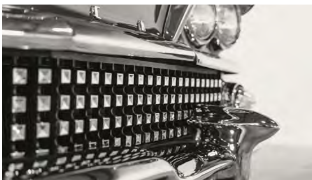
1958 BUICK LIMITED