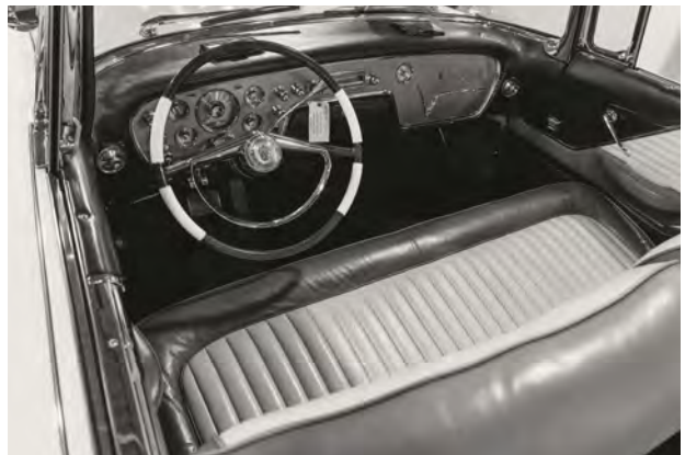
1955 PACKARD CARIBBEAN

Step into a world of chrome, fins, and jet-age dreams at the Golden Era Exhibit, a special showcase at the 2025 New York International Auto Show celebrating the unforgettable style of the 1950s. This was the decade when cars became more than just transportation—they became rolling works of art, symbols of prosperity, and cultural icons that defined a generation. This exhibit features three standout vehicles that embody the spirit of the decade: the 1957 Cadillac Eldorado , a symbol of post-war luxury and elegance; the 1958 Buick Limited , a bold expression of mid-century design excess; and the 1955 Packard Caribbean , a rare gem from one of America's most storied brands. Each model tells a story of style, craftsmanship, and the spirit that defined the era.